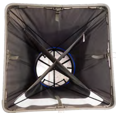
Hood with flow straightener