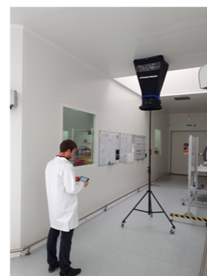
Use with the telescopic tripod