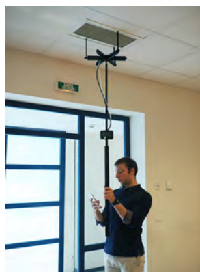
Use with the measurement grid