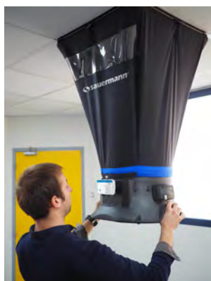
Use of the air flow meter